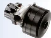
Fitted With Powerful Tangential By-Pass Motor